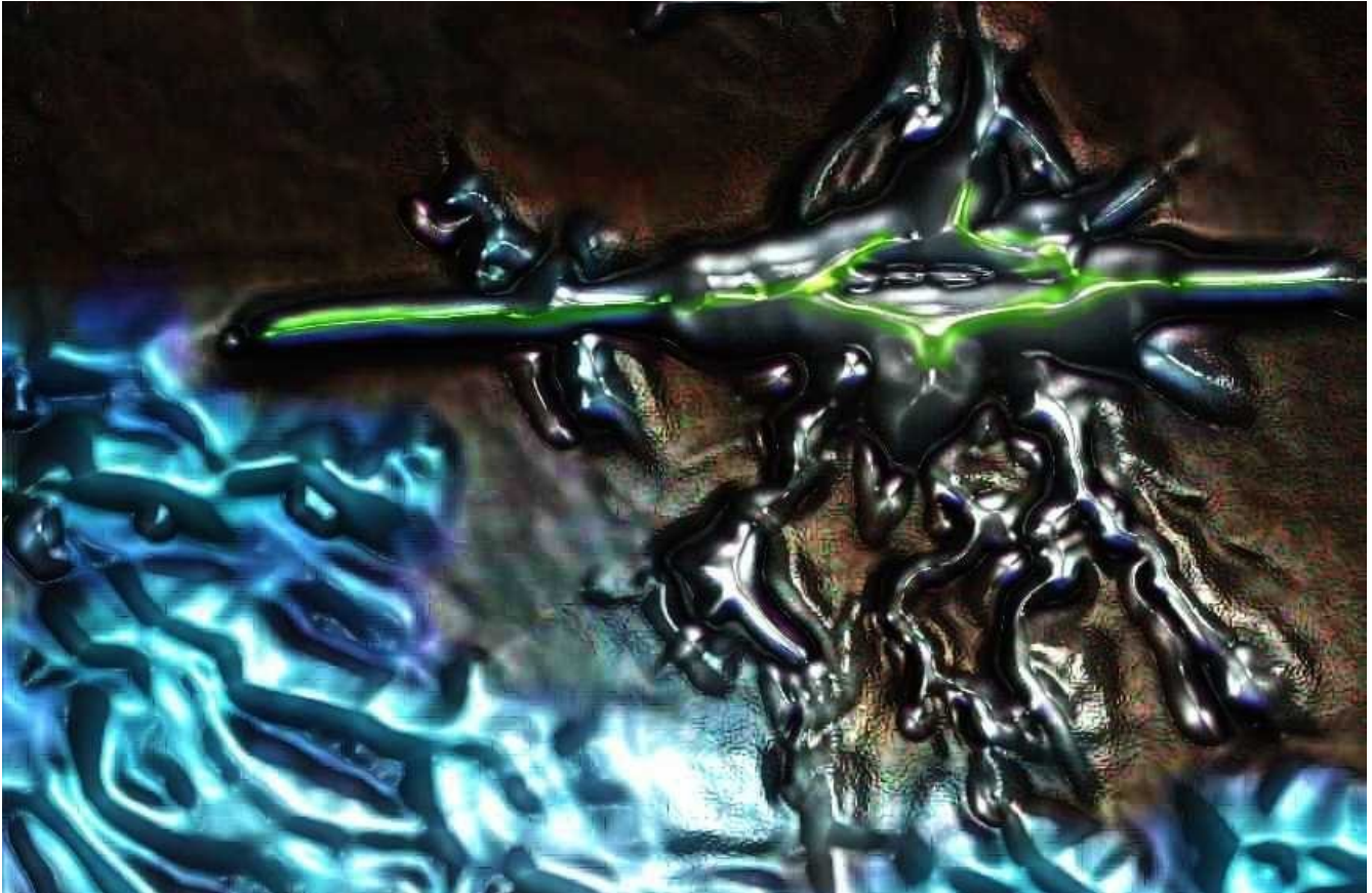
Illustration 1: Airbrush painting by Brent

This is an abstract Of one of the originals paintings I did of it, I put lightning down through the center, and then lacquered it in paint shop pro, and got this: