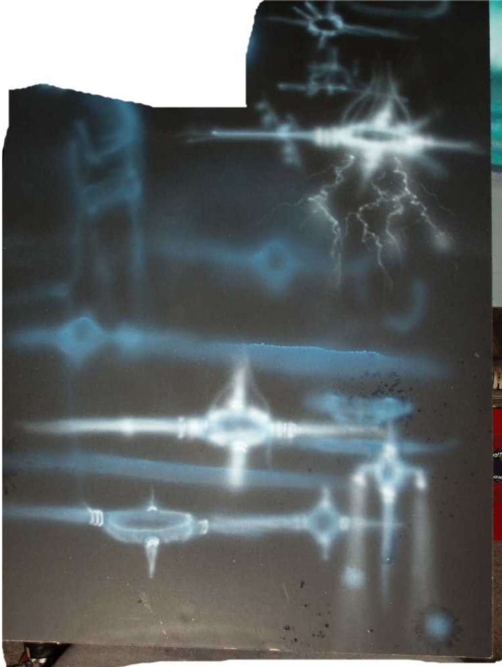
Illustration 3: Airbrush painting by Brent

This is again what I painted right after I saw the thing, note the lightning. I didn't see that; I could feel it though. The top two images are are Brent's drawings of his friends description.