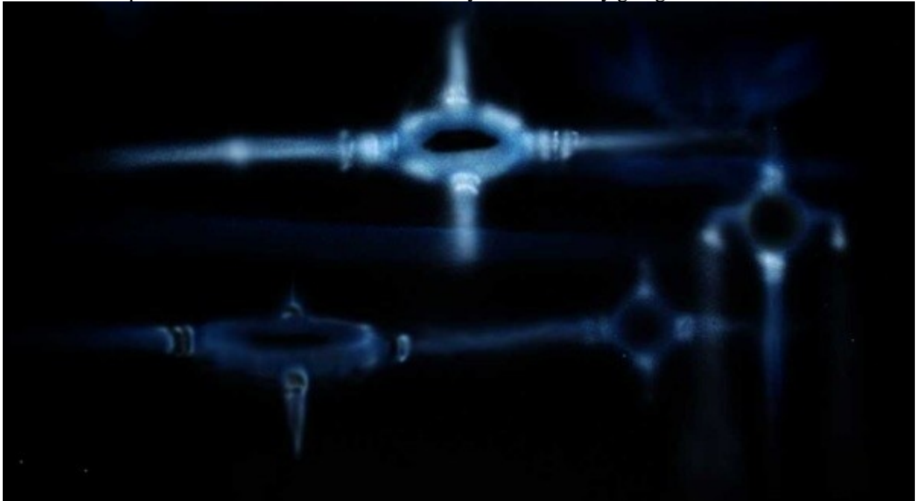
Illustration 2: Airbrush painting by Brent

This is what I painted 5 minutes after I saw it with my airbrush in my garage.